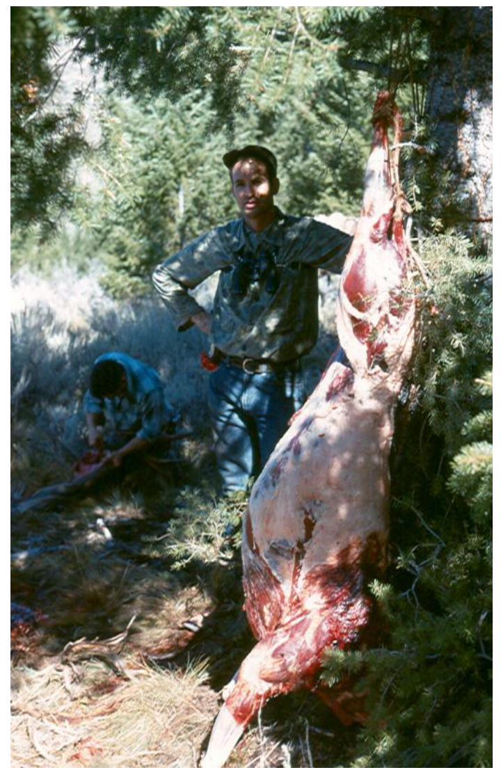
Photo of skinned carcass of one of the buck mule deer racks on the front page of this issue. Author, kneeling in background, removed cape from skull after preparing meat for cooling. Note healthy fat layer over most of body.