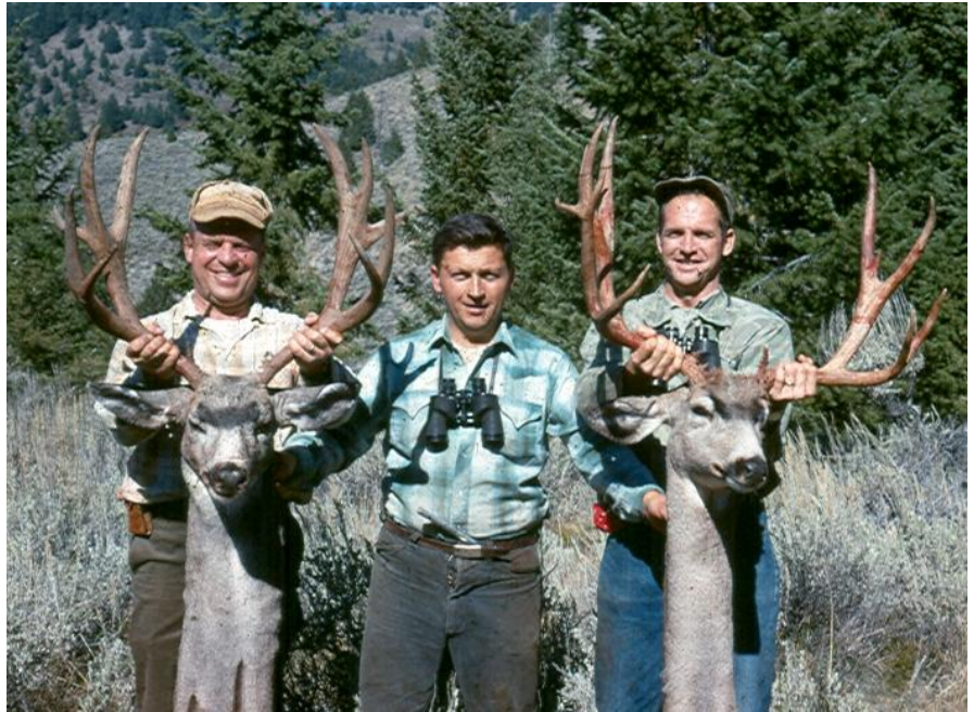
Author and hunter on left with 5X5 mule deer buck (plus brow tines). Hunter on right killed 5X4 buck (plus brow tines) at same location on same day.

After I presented copies of Outdoorsman Bulletin #7 to the Idaho F&G Commission in Orofino on November 17, 2004, a reporter who is also a hunter asked me if both of the buck racks held by the hunter on the front page were actually killed in Unit 26. I replied that they were both killed there, along with two other large bucks, by the same two hunters during the opening week in September.